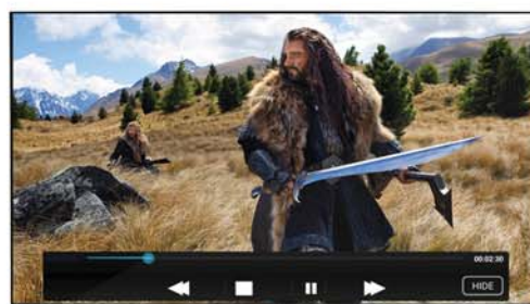
Regular TV with PalNano Smart Hub