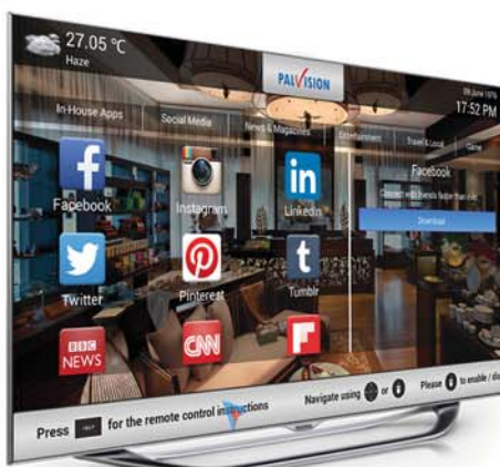
Samsung Smart TV Integration

From crystal clear TV channel reception, through fully customisable user interfaces & advanced features such as Wireless Screen Mirroring, PalTV transforms in-room TV sets into powerful entertainment, information & communication hubs.