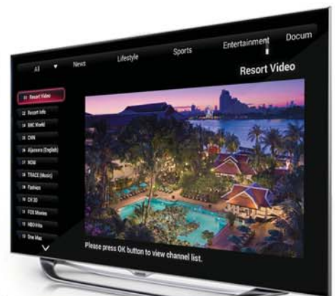
Samsung Smart TV Integration